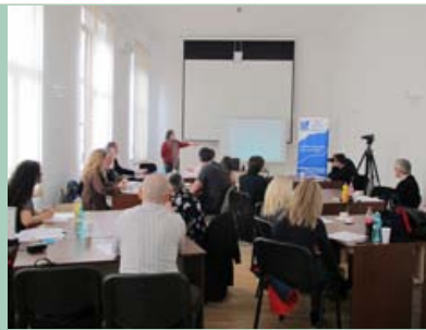
HeaRT Info Day in Bucharest, October 25